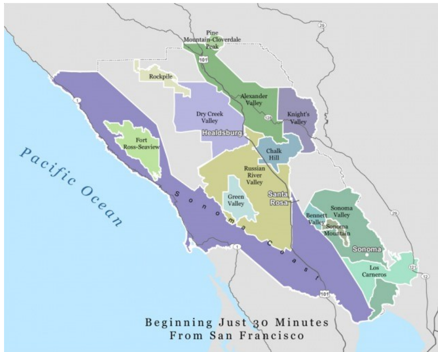
Detailed map of Sonoma A.V.A.