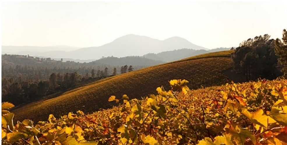
VOLCANO RIDGE VINEYARD